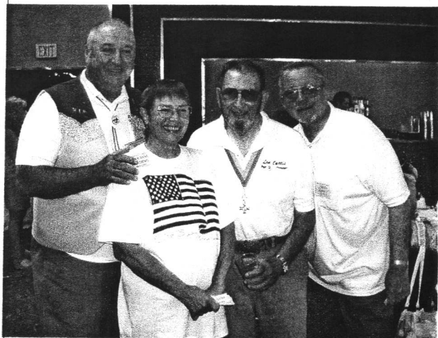
Old and New Mix it Up!