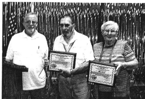
Mr. "Has Been" with the Godparents