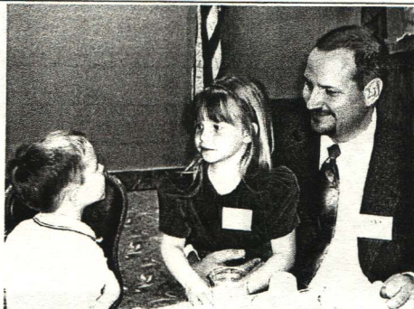
Hi-level Strategy Meeting