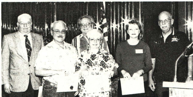
New Members Get Their Certificates