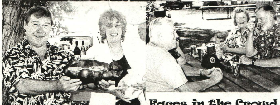
Faces in the Crowd