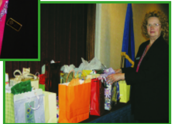
Lots of Gifts for Pot o Gold