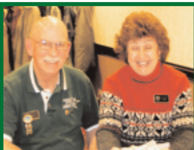
the money people