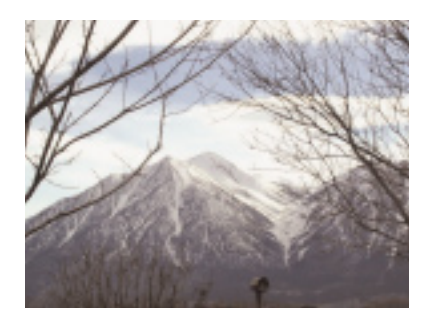
IFA, Carson Valley Chapter #72 P.O. Box 2242 Minden, NV 89423