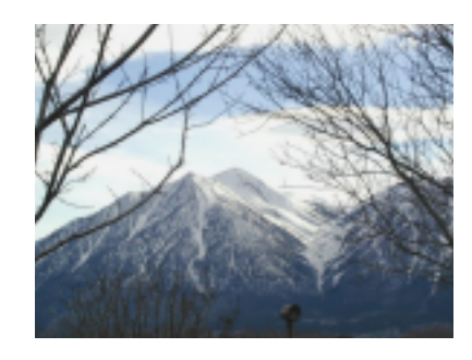
IFA, Carson Valley Chapter #72 P.O. Box 2242 Minden, NV 89423