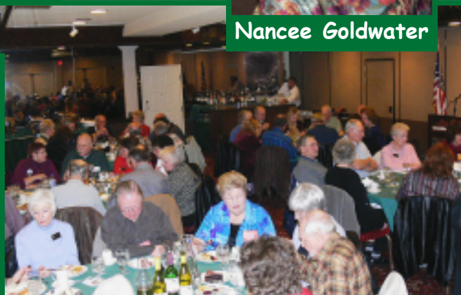
Members Enjoying Dinner at CVI