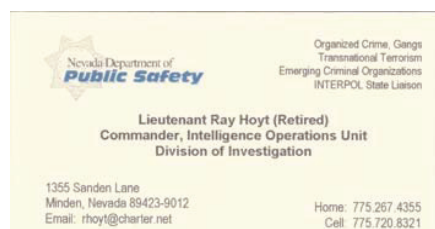
Nevada Department of Public Safety

775-782-2338 ph 775-782-2335 fax accolades1@aol.com