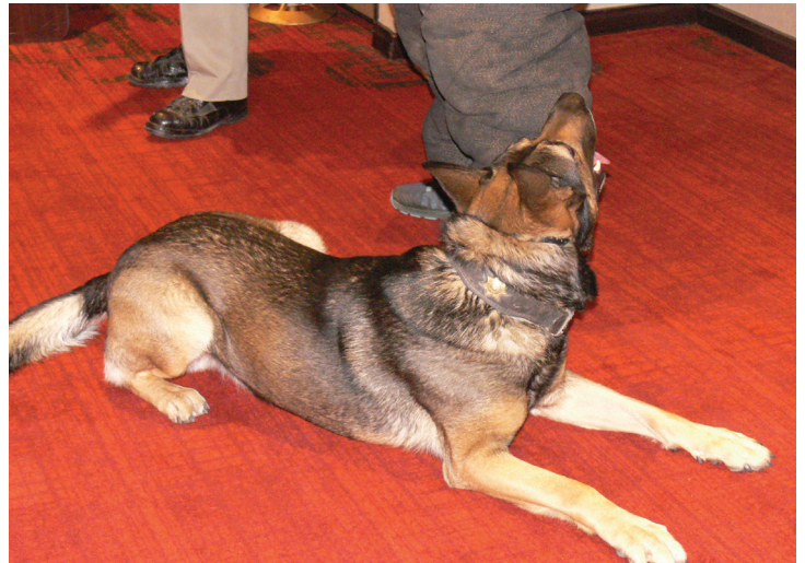
Douglas County Sheriff's Office K-9 Shadow