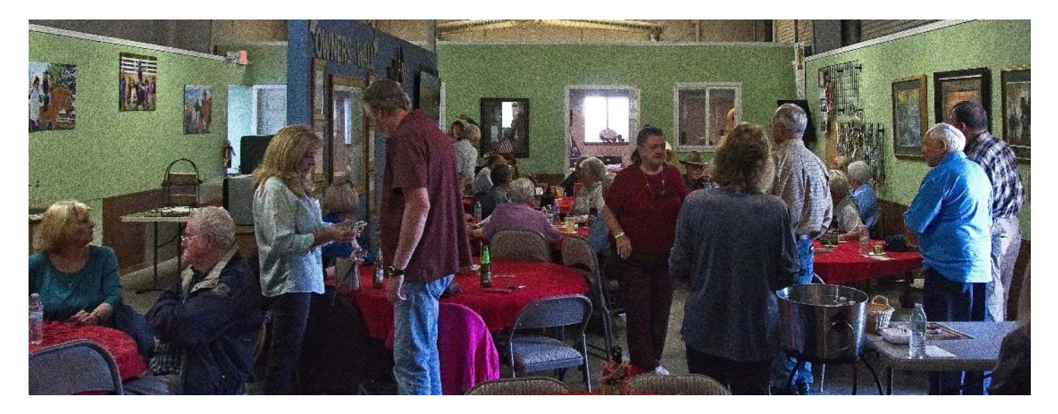
Footprinters gathered at Kids and Horses Venue