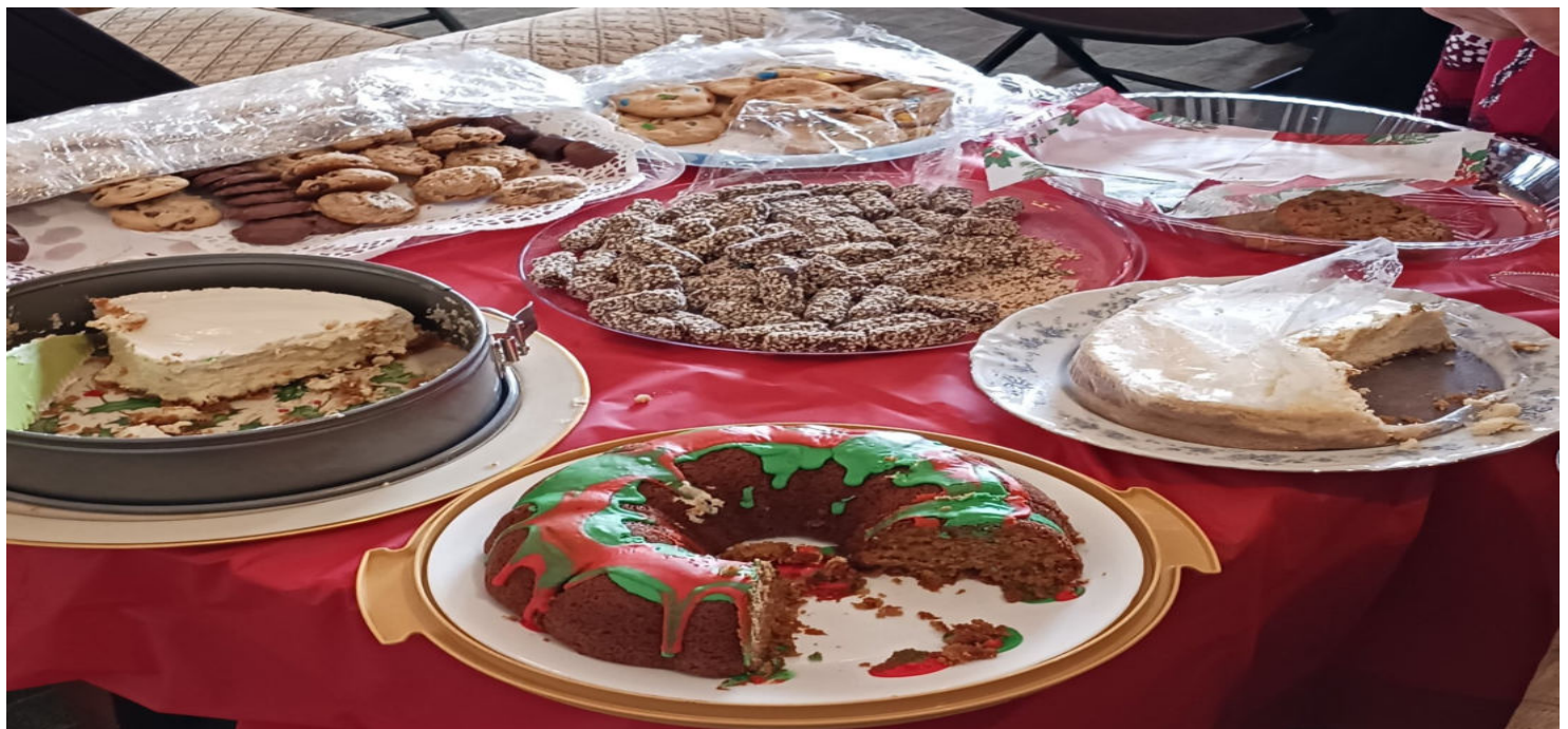
Last of all the Rest of the Dessert