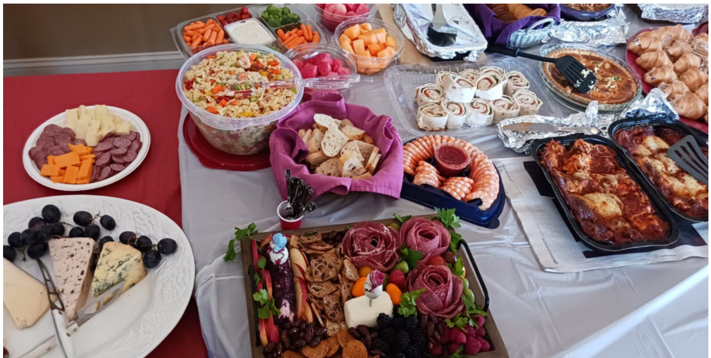
Absolutely The Best Food