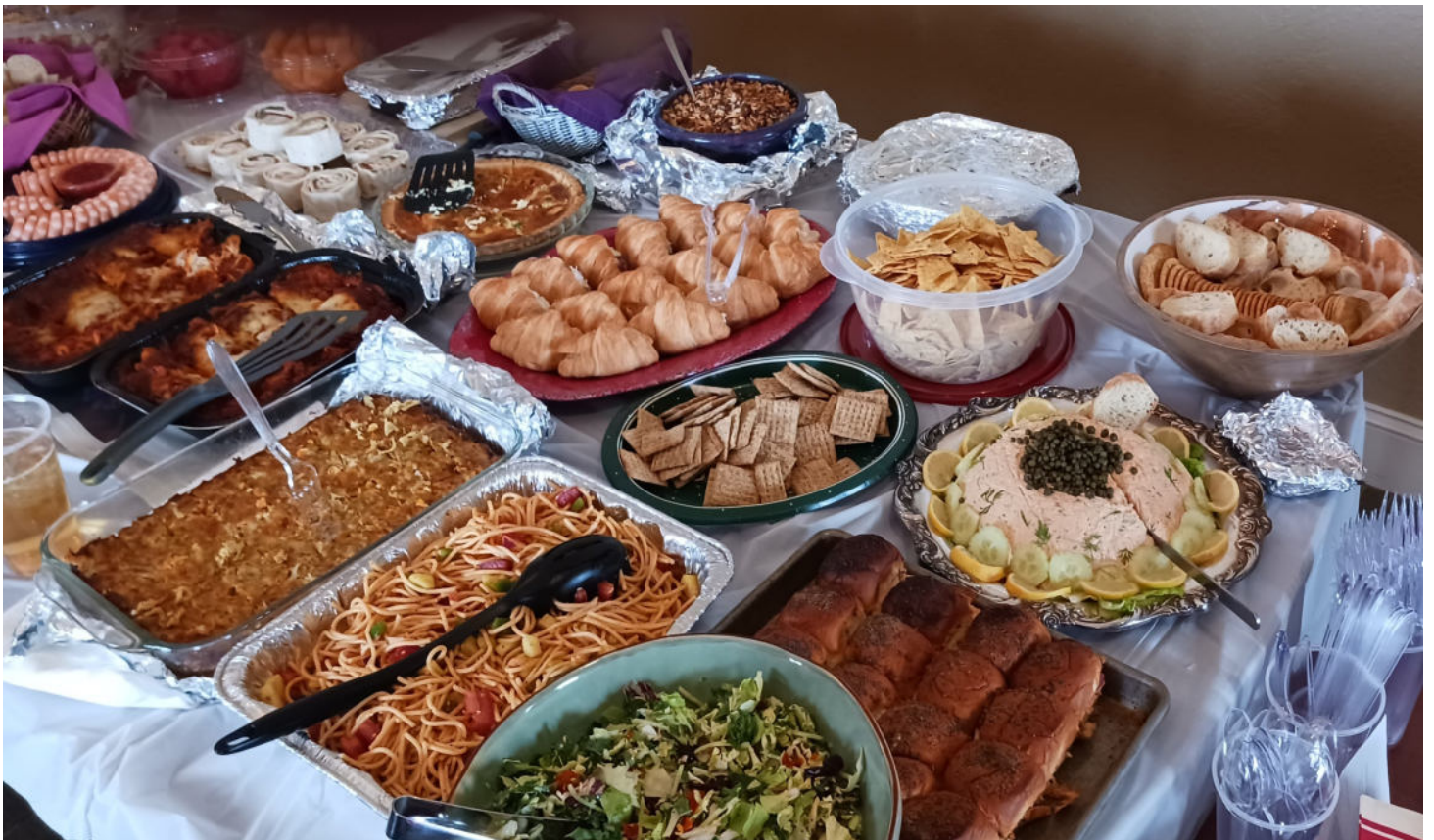
What A Feast for Our Christmas Party