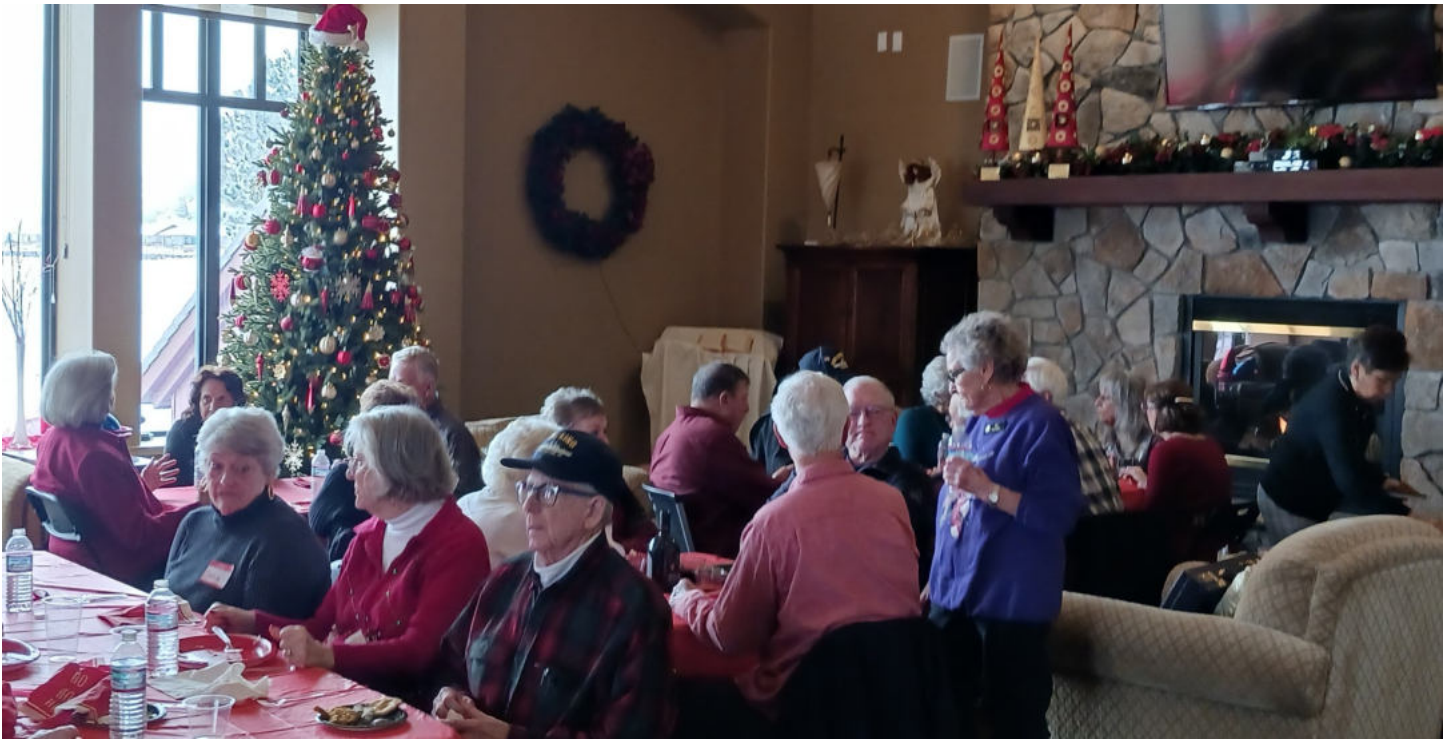
Wonderful Christmas Setting