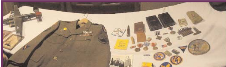
This picture depicts a great deal of courage. It does not however, speak of the freedom it saved for all Americans!