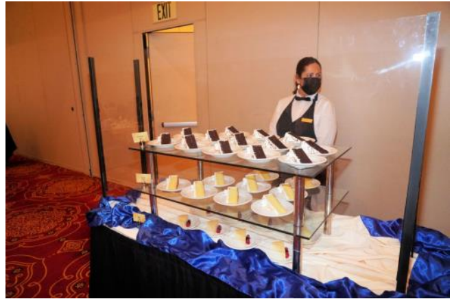
..and delicious desserts!.