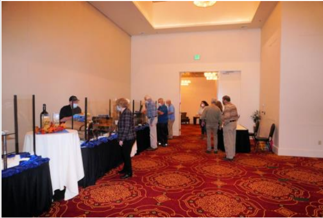
Finally, a Buffet