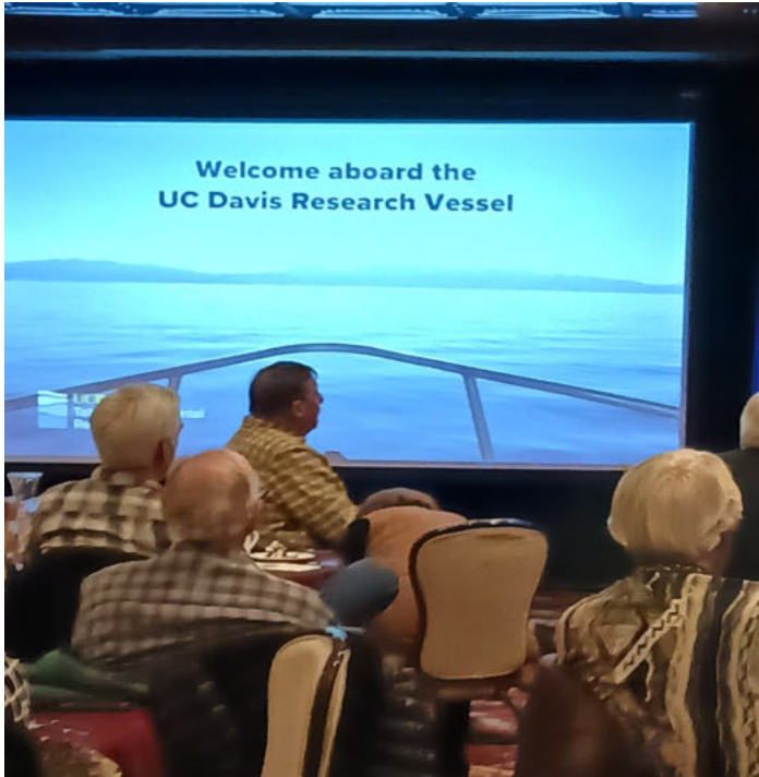
Research Vessel driven by Baylan